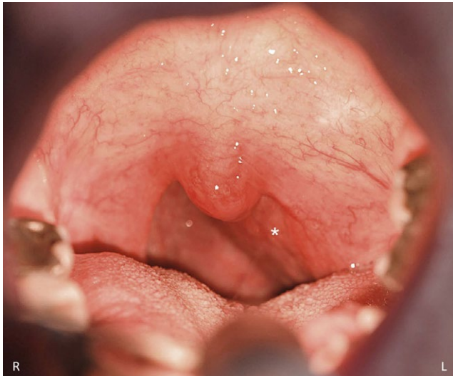
FIGURE 1 Transoral examination of the oropharynx showing an extensive bulging of the lateral pharyngeal wall (white star)

firm submucosal mass of the parapharyngeal space extending from the lower one-third of the nasopharynx to the lower aspect of the tonsillar fossa (Figure 1). Magnetic resonance imaging (MRI) showed a 6 \times 4 \times 2 cm homogenous parapharyngeal mass which appeared hyperintense on T1-weighted sequences and hypo-intense on T2-weighted sequences (Figure 2A,B). The mass extended beyond the midline to the right side and caused stenosis of the upper airway with no neck lymphadenopathies. The radiological pictures highly suggested the presence of a large lipoma of the parapharynx. A complete surgical excision of the mass was performed (Figure 2C) using a transoral approach. Histopathologic examination confirmed the suspected diagnosis of a lipoma. The post-operative course was uneventful, and the patient was discharged home on the second post-operative day. One month following surgery, the patient reported complete relief of all day symptoms. Follow-up sleep exam 4 months postoperatively showed a decrease of AH index from initially 42 to 11 per hour (without CPAP) and a decrease of the Epworth Sleepiness Scale from 6 to 3 out of 24 points.