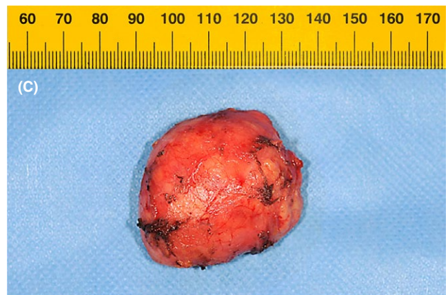
FIGURE 2 Sagittal (A) and coronal (B) MRI sections (T1-sequences) of the upper airways. The images show a homogenous parapharyngeal mass adjacent to the masticator space laterally, extending to the retropharyngeal and carotid space dorsally. The mass is narrowing the upper airways at the level of the oropharynx. There are no signs of malignancy. (C) Resected specimen of the well-defined and encapsulated (histologically confirmed) lipoma

is diagnosed. Although most OSAS cases in adults have multiple etiologies 3 such as excess weight, eating, and drinking habits, decreased nocturnal muscle tone or central nervous