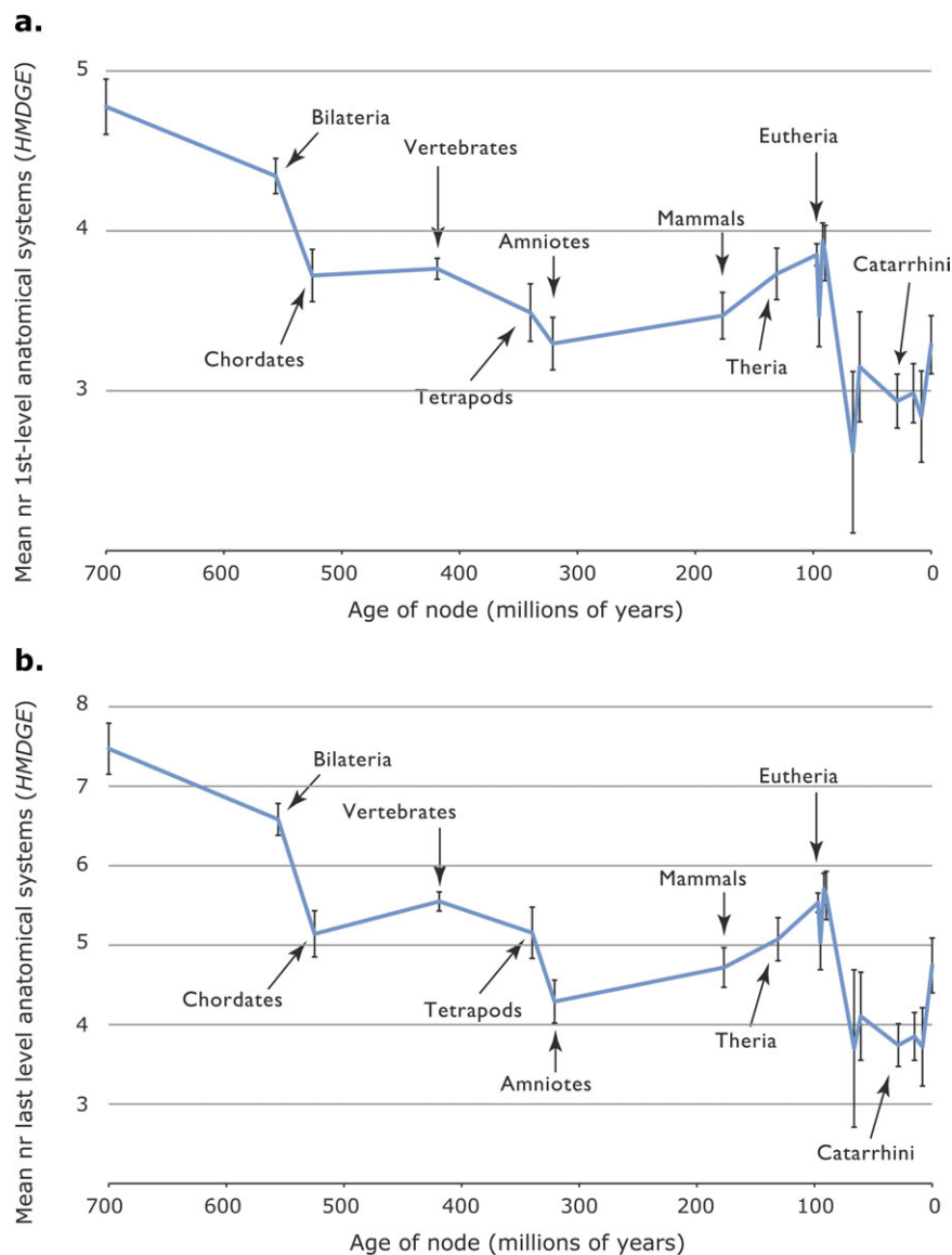
FIG. 2. —Mean number ( \pm standard error) of first-level (a) and last-level (b) anatomical systems in which human genes are expressed (6,585 genes with available HMDEG expression data) as a function of their first appearance in the phylogeny.

have steadily increased at an average rate of about 0.33 cell type per million years (Valentine et al. 1994). In figure 3, we show that the rate of increase in gene tissue specificity correlates with the relative rate of increase in the maximum number of cell types in the corresponding taxa.