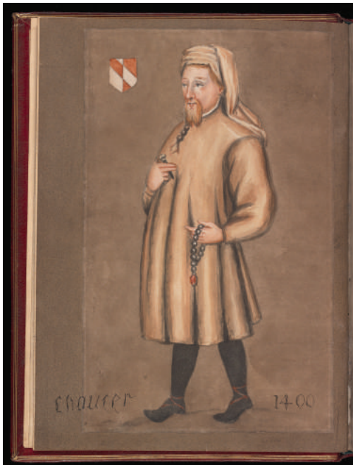
Fig. 3. A modern painted portrait of Chaucer in the Speed tradition added as frontispiece to The Canterbury Tales , with the poet's name and the date "1400" later added in an archaizing script. Beinecke Rare Book and Manuscript Library, Yale University, Takamiya MS 32, fol. 2v. Reproduced courtesy of the library.