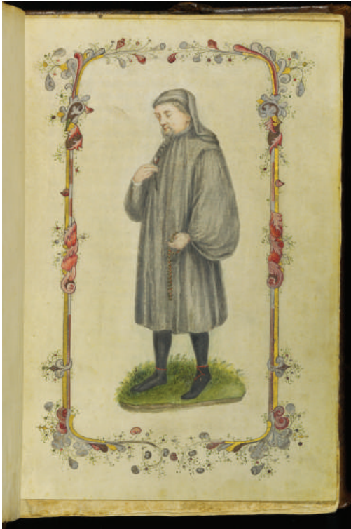
Fig. 2. An eighteenth-century painted Chaucer portrait inserted as a frontispiece in a copy of Caxton's The Canterbury Tales (circa 1476). © The British Library Board, 167.c.26. Frontispiece.