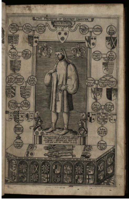
Fig. 1. John Speed's Chaucer engraving in Speght's Workes (1598).

haps a penner, or pencase, hangs from his neck, signifying his status as a man of letters and connecting the text printed in Speght's edition to its written manifestation as a product of Chaucer's hand. 3 A panel of text positioned underneath the figure of Chaucer announces its provenance: