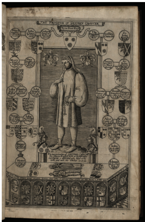
Fig. 1. John Speed's Chaucer engraving in Speght's Workes (1598).

haps a penner, or pencase, hangs from his neck, signifying his status as a man of letters and connecting the text printed in Speght's edition to its written manifestation as a product of Chaucer's hand. 3 A panel of text positioned underneath the figure of Chaucer announces its provenance: