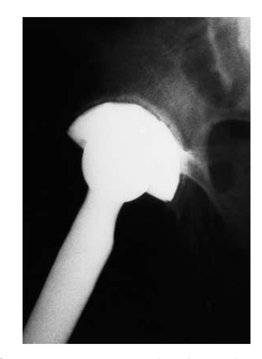
Fig. 2 Roentgenogram (Lowenstein-lateral view) of an Opti-Fix cup. A 43-year-old, symptomatic, female patient, at 9-years follow-up. Linear radiolucent line present in zone 1, 2 and 3; cup fibrous "unstable". Small acetabular component measuring 46 mm, 28 mm head (ceramic) and (thin) excentrically worn polyethylene liner

Preoperatively the mean HHS for all 127 hips was 43.7 (range 3–79). At the most recent follow-up evaluation the mean HHS reported was 89.8 (range 57–100). No patient was eliminated due to debilitating factors other than the joint. When comparing clinical scores, no significant