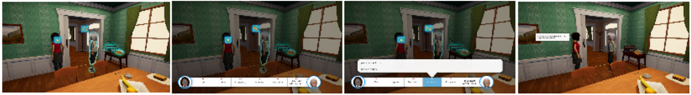
Figure 3: Sequence of interaction

circle will pulse in the upper right or left corner to indicate that all dialogues close to it, belong to it.