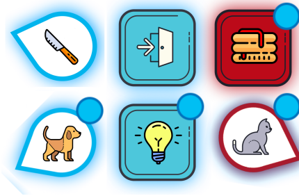
Figure 2: The iconography as they represent elements in the game. Left icons: off-screen objects. Central icons: replacement (top) or obstructed (bottom) icons. Right icons: active but non clickable objects – in red. The blue spot indicates that the referred object emits a dialog

These arrows are placed at the height corresponding to the height of the hidden object. This, together with the arrow, provides exact information about the actual direction of the object. If the latter is directly above or below the camera's view, the pointer migrates to the top or bottom corner and points inwards in the correct direction.