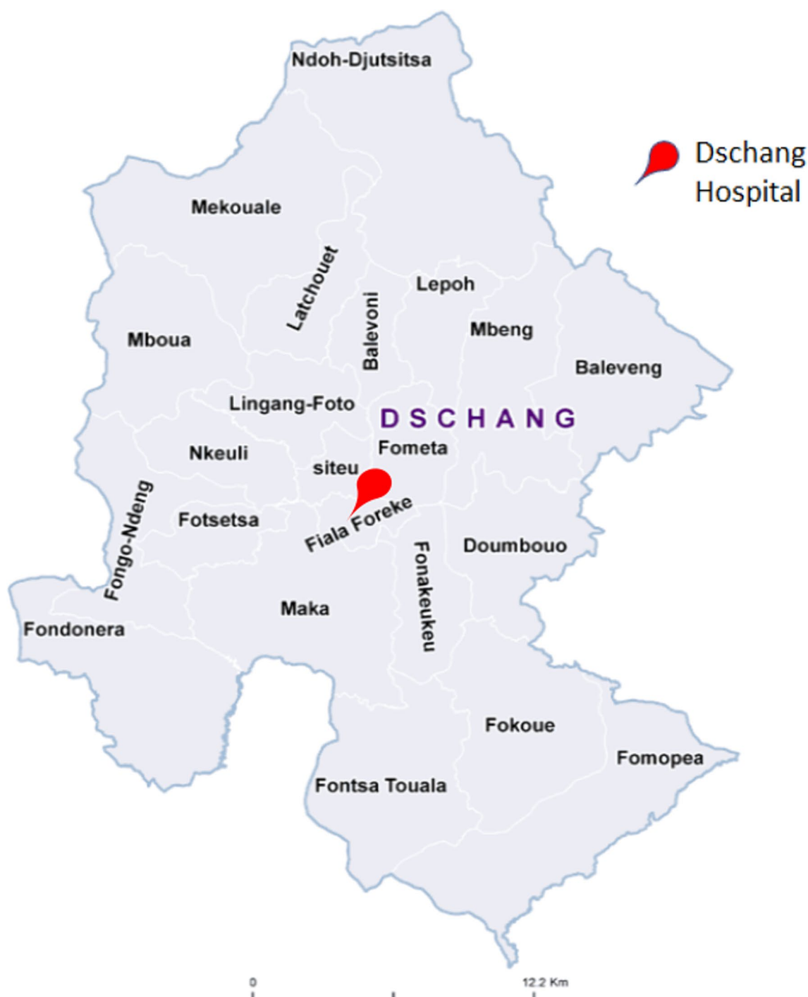
Fig. 2 Map of the health areas of the District of Dschang, West Cameroon, modified from Ministère de la Santé Publique du Cameroun ( https://dhis-minsante-cm.org/portal/ ), used from a publication with permission of Datchoua Moukam A.M. [16]

money. Because I've already had to talk to white women, after three months they leave, there's already my name in Geneva, you came, you called me, that means that it stays in your memory." (Fometa02).