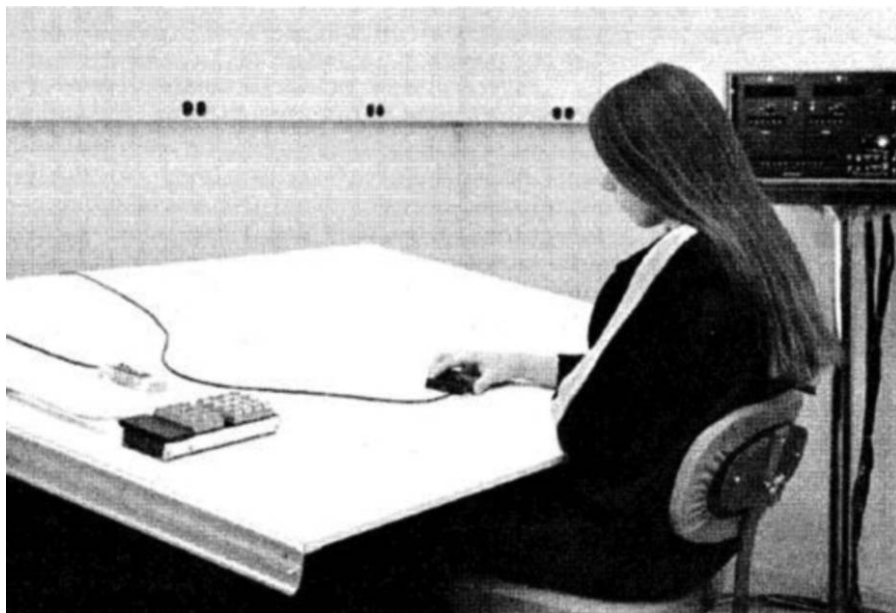
Figure 1. A Bendix Datagrid Digitizer in use at the U.S. National Center for Atmospheric Research (NCAR) in the 1970s. The operator moved a crosshair-style cursor across analog maps placed on the table's gridded surface. Centering the cursor on a gridpoint, she then used a keyboard (see fig. 2) to enter the value of the isoline nearest to the gridpoint.

readily manipulated by computers. This “digital convergence” has, of course, continued into the Internet era, when virtually all media use digital formats. Data are increasingly “born digital” (and electronic), a fact well known to all photographers who mourn the loss of analog film. So while the growth of digital data started long before the advent of computers and the Internet, its most dramatic expansion began with the full-scale conversion of previously analog techniques and instruments to “digital” (numerical, discrete) ones starting in the 1940s.