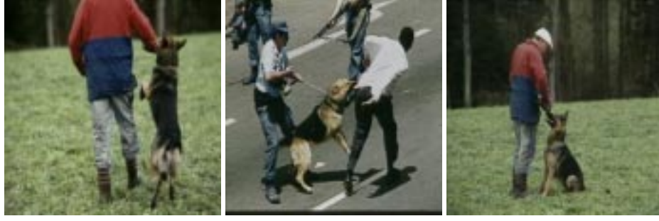
Figure 1. An example where the semantically more distant image is considered closer to the query: Viper 6 (in high-speed-low-quality mode) considered the middle image closer to the left image, than the right image. This is due to matching the black trousers of the man in the middle picture to the dog jumping in the left picture. However, clearly the semantics of the right image is closer than the left.