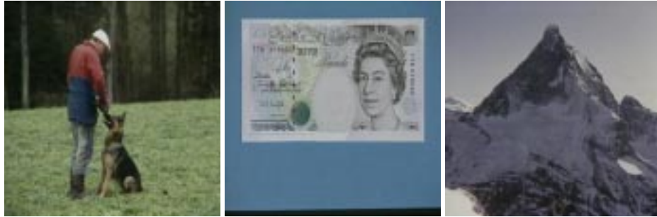
Figure 2. An example that illustrates that in many cases, a sensible answer does not exist. During the browsing process, often the user is confronted with questions like the following: “What is more similar to the image of the man and the sitting dog: the mountain or the pound note?” Stochastic browsers provide the user a possibility to decline an answer if the selection does not offer the possibility for sensible feedback.