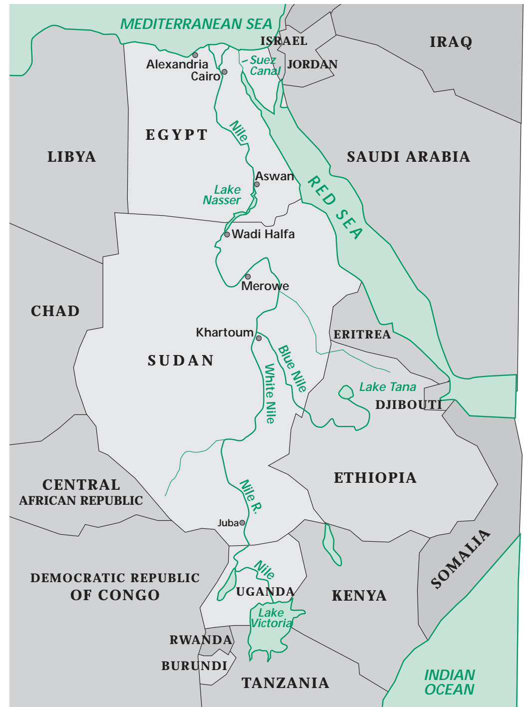
The Nile Basin