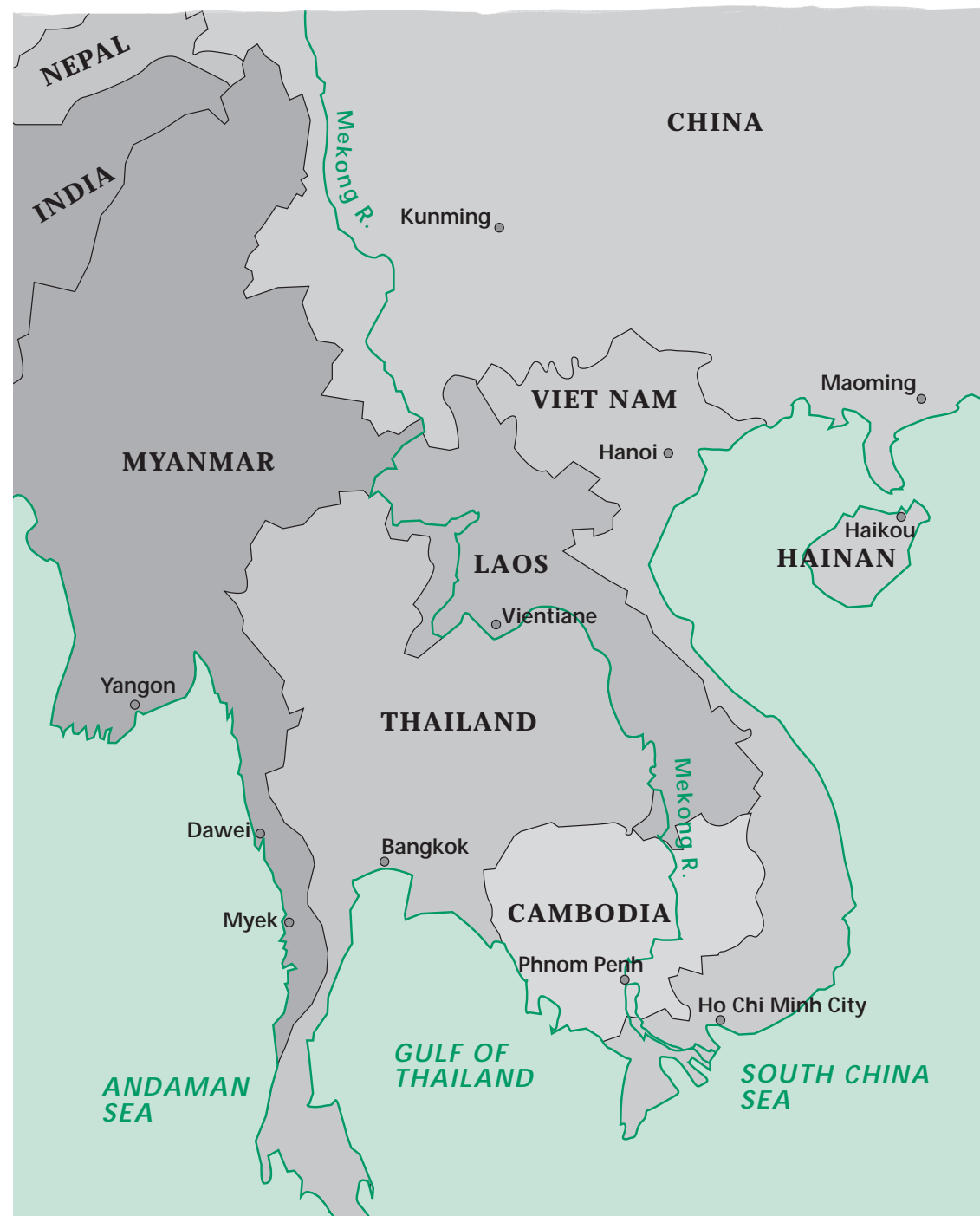
Map 6 The Mekong River Basin

In addition, compared with the previous schemes which had projects to integrate hydro-power, irrigation, navigation and flood control, the new Commission appears to have a "dam-