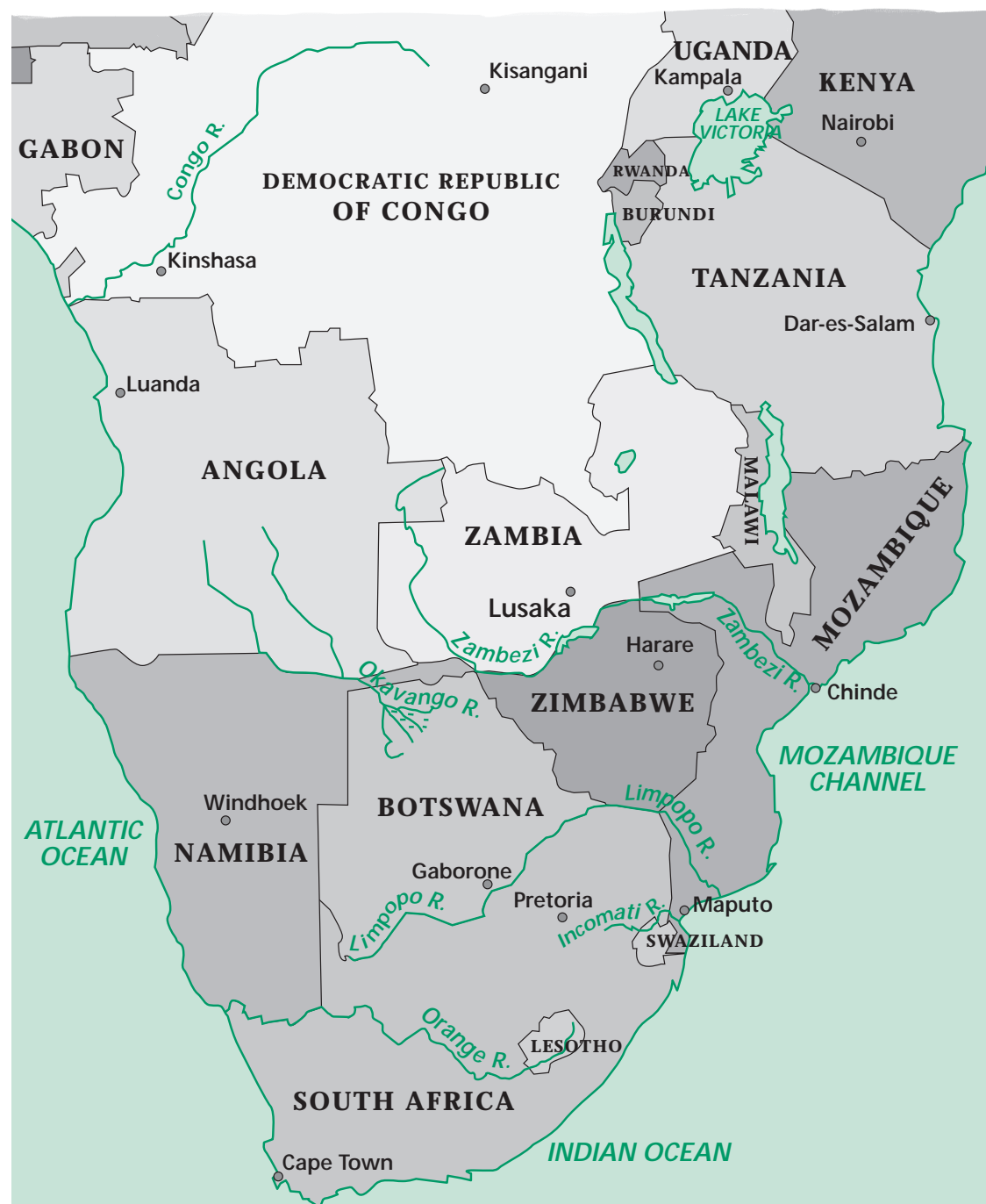
Map 5 Major Transboundary River Systems in Southern Africa

With this Protocol, SADC has taken the opportunity offered by the natural partnerships created by shared watercourses to foster yet another area of cooperation between its members. In so doing it establishes still more ties to strengthen its union, which will encourage further cooperation in other areas, and provides a framework for the crucial protection of water supplies and aquatic ecosystems, without prejudicing the sovereign rights of its members. For now the Protocol resembles too strongly the traditional water monitoring agreements and needs reinvigorating and linking to economic development, tourism and other key aspects of SADC's programmes. There is also the need to move from theory to action for SADC to become the strong regional actor that it promises to be in water and other areas. The Water Protocol is currently under review, with the intention being to strengthen the regional commitment to water cooperation and to bring the Protocol in line with the 1997 UN Convention. Hydropolitical tensions linger in many areas of Southern Africa; it is hoped that the states will allow SADC to consolidate and empower itself sufficiently to resolve these problems before any crises erupt.