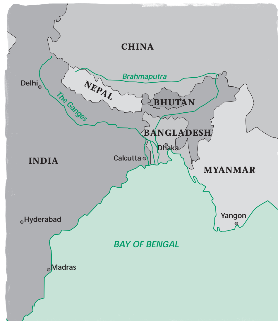
Map 1 The Ganges - Brahmaputra Basin

to take up six shared rivers for which treaties will be discussed. The highest priority is being given to the Teesta River. Thus the Treaty has clearly provided both countries with an opportunity for meaningful cooperation over the Ganges Basin as well as other shared rivers.