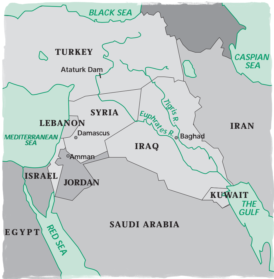
Map 7 The Tigris-Euphrates Basin

Unfortunately the international community has shied away from this conflict and little attempt has been made at neutral assessment and mediation. Turkey is one of the three states which voted against the 1997 UN Convention, and Syria is one of the six States which has actually ratified it: therefore they exist at opposite ends of the spectrum and any referral to the terms of the Convention is rejected by Turkey. International Law cannot resolve this conflict. Other issues are intertwined with the water question making relations between the three states volatile.