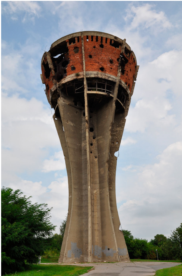
Figure 1. The water tower in Vukovar.

Museum is certainly worthy of interest. This museum dedicated to the first president of Bosnia was founded in 2007 and became independent in 2012. Its management is closely connected to the nearby Kovači Martyrs cemetery where Izetbegović is buried. An important memorial project was implemented in the area, involving a wall of names and an exhibition on the Bosnian war, following the recent construction of an auditorium.