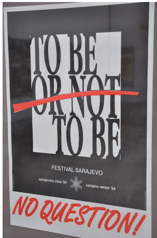
Figure 3. Sarajevo film festival poster in 1994.

Croatian war veteran groups are thus largely involved in tourism structures, strongly influencing the narrative and the general interpretation of this heritage. As a result, one can observe the production of unilateral narratives on war that are dominated by the Croatian community.