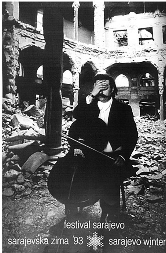
Figure 2. Sarajevo film festival poster in 1993.

However, they also highlight tourists' fascination with violence and conflict, illustrating it by the used bullets and mortar available in tourist shops, even mentioning the possibility for visitors to buy victims' shoes. One can see here a paradox in the touristification of war, with the promotion of Sarajevo spirit on the one hand, and a fascination with violence on the other. The latest contributes to producing 'balkanik' representations, described by Torodova (2009) as Western and romanticized conceptions of the region based on violence, primitivism and savagery.