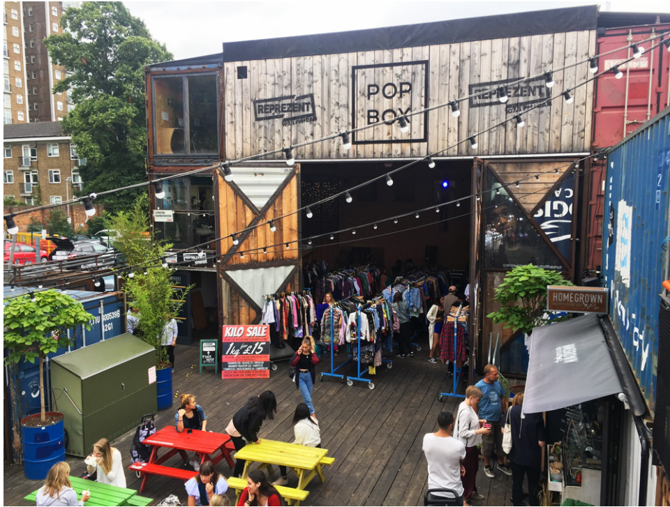
Fig.5: Pop Brixton, personal photo, July 2017.

'TimeOut readers' (in reference to an arts and entertainment guide in London) and explains that Pop Brixton isn't frequented by locals.