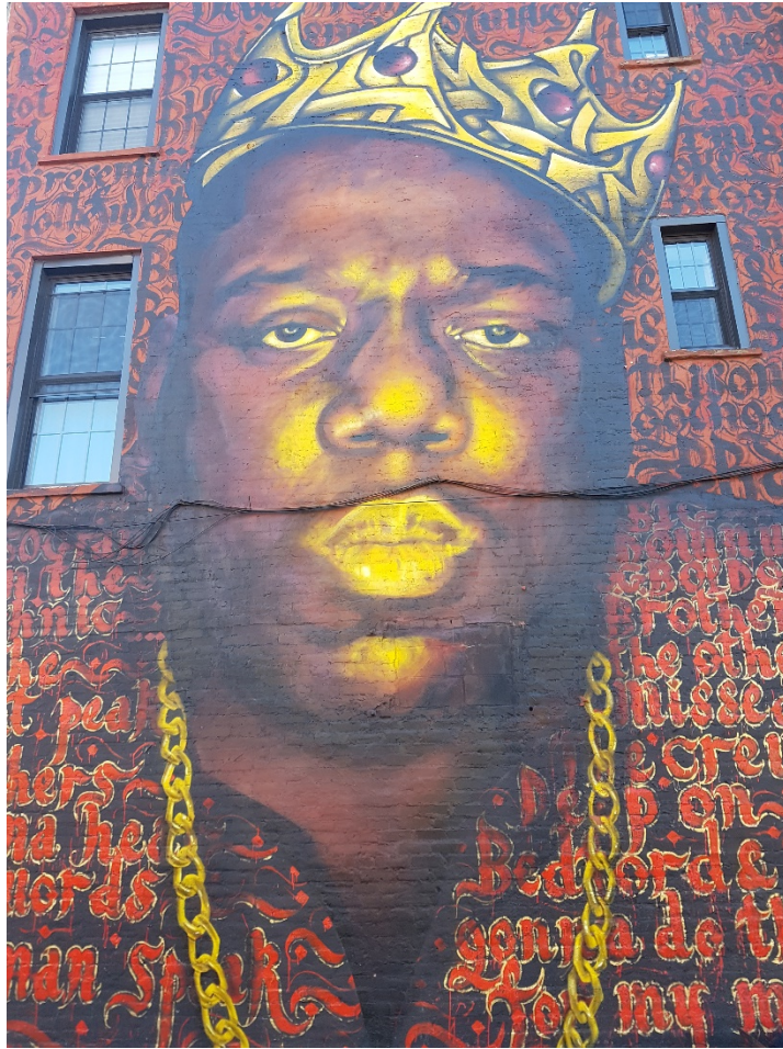
Fig.7: Notorious B.I.G. mural in Brooklyn, December 2017.