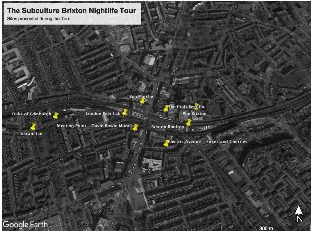
Fig 3: Map of the Subculture Brixton Nightlife Tour, 2017

tours are discreet. He has no interest in forming contractual relationships with the various sites and businesses he visits on his tours. The guide offers groups the chance to explore places he calls 'out of the way and out of the ordinary'.