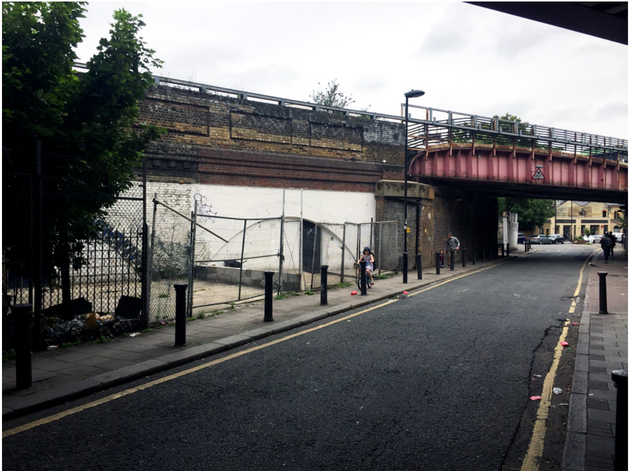
Fig.4: Run-down community area, Brixton, July 2017.

Leaving the microbrewery, the tour heads for a less-frequented area: a run-down concrete lot surrounded by a chain-link fence. In its centre is a rusty barbecue for the inhabitants of the dilapidated houses nearby. There are also several small shops catering to a primarily local clientele.