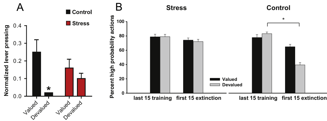
Fig. 2. Comparison of the influence of stress manipulation on the habitual and goal-directed systems. (A) In the study conducted on rodents, after a training phase, a highly palatable food was devaluated by being eaten until satiation. After devaluation, control rodents diminished the effort invested in the instrumental action leading to the devaluated outcome, whereas stressed rodents did not. (B) A similar effect was found in the study conducted on humans. Reprinted from Schwabe and Wolf (2009) and Dias-Ferreira et al. (2009).

effort mobilized to obtain food, how much food is wanted under stress), which is, rather, controlled by the Pavlovian system.