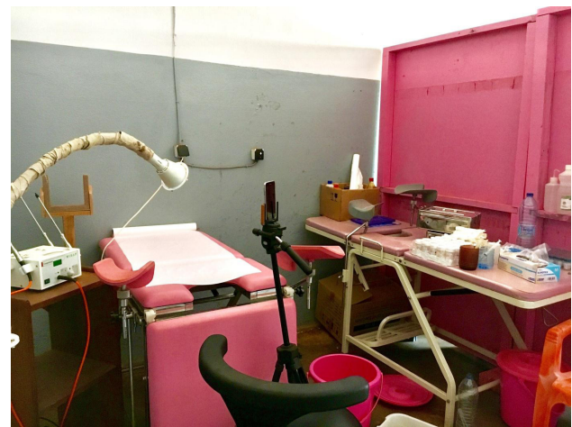
Figure 2 Device including the gynecological table, smartphone and tripod.

Once the patient record was created, the cervical images were acquired in a precise sequence: native, VIA, VILI and posttreatment whenever this was performed. The flash