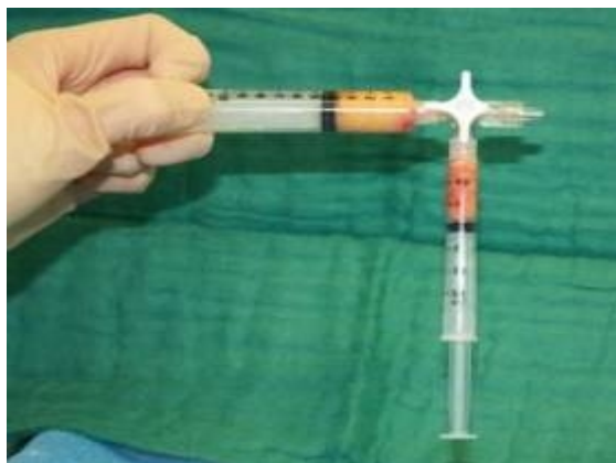
Fig. 3: Purified fat transfer from 10 ml Luer Lock® syringe to a 1 ml Luer Lock® syringe through a 3-ways connector.