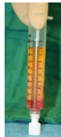
Fig. 1: Harvested fat after centrifugation: 1) Upper part: Oil from damages adipocytes, 2) Middle part: Purified fat, and 3) Lowest part: Red cells, cell's debris and liquids.

The ideal method for fat purification would separate blood, infiltration fluid, and cell debris from healthy adipocytes with minimal trauma (Figure 1). This particular step is the most debated part of the fat grafting procedure, subjected to intense scrutiny without, however, a definitive solution. While various methods for separating out fat have been described, none has been determined to be superior to the others, but it is accepted that techniques involving less manipulation may have better outcomes including (i) Sedimentation: Aspirate material stands for 30 minutes to 1 hour, which separates it into its various components; 41 (ii) Washing: aspirate fat is washed with 5% glucose solution, 0.9% normal saline, or sterile water; 42 (iii) Filtration: Harvested fat is placed on sterile gauze over sterile cup, washed with ringer's lactate and dried before loading into syringes; 43 (iv) Centrifugation: Harvested fat is centrifuged 3 minutes at 3000 rpm. This method separates fat from substances that increase degradation, and concentrates adipocytes and stem cells per milliliter of fat transplanted. 44 It is the most rapid and clean method.