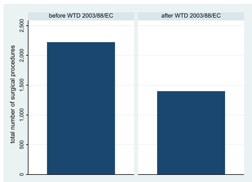
Fig. 2 Bar chart illustration of the mean total number of surgical procedures (y-axis) performed throughout residency before and after introduction of the European Working Time Directive (WTD) 2003/88/EC (x-axis). It was higher before as compared with after introduction of the WTD 2003/88/EC (2130 vs. 1338, p = 0.007 ).

There was no significant influence of the country of training on the total reported caseload ( p = 0.443 ; Supplemental Figure 1).