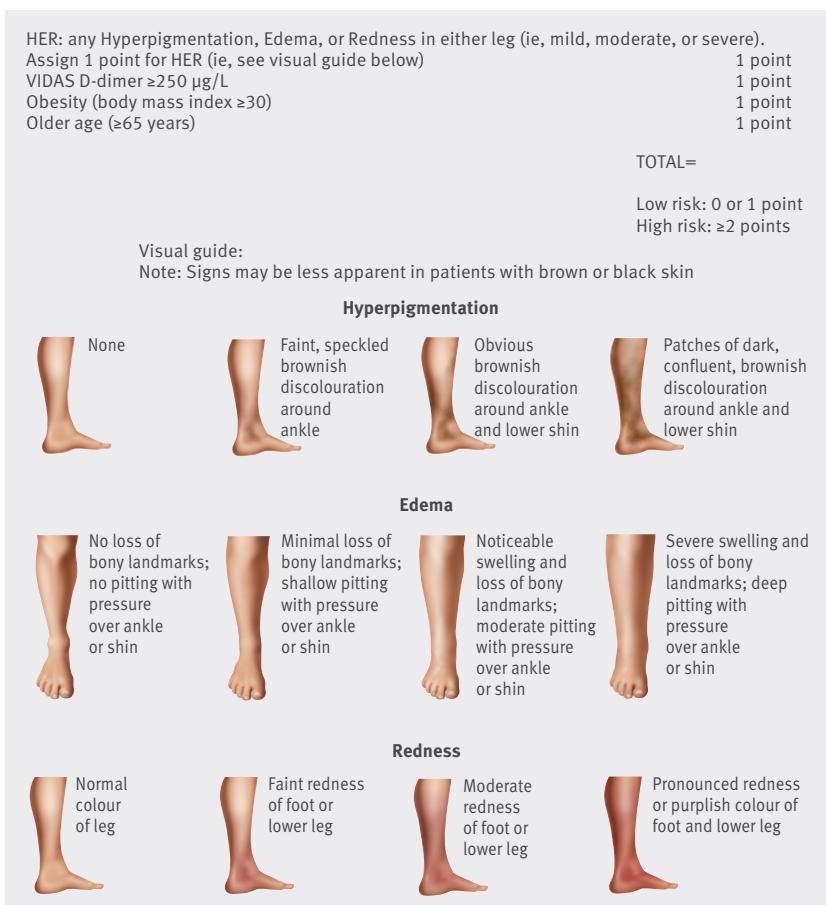
Fig 1 | HERDOO2 score to identify women with unprovoked venous thrombosis (VTE) at low risk of recurrent venous thrombosis. Visual guide adapted from Kahn et al 16