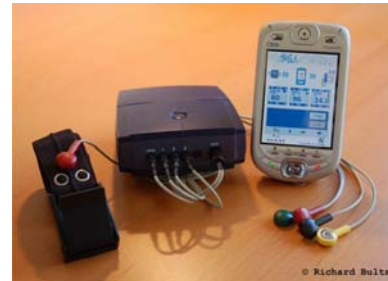
Fig. 3. Example of front-end based MobiHealth BAN.

Applications that run on top of the service platform can either be deployed on the MBU (for on-site use, e.g. by a visiting nurse) or on the servers or workstations of the healthcare provider, e.g. a call centre or secondary care centre. Applications that use the m-health service layer can range from simple viewer applications (e.g., PortiLab2 of Twente Medical Systems International (TMSI)) that provide a graphical display of the BAN data, to complicated applications that analyze the data and provide personalized feedback to a patient.