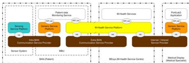
Fig. 2. MobiHealth Service Platform® Functional Architecture.

The healthcare BAN is only one part of the MobiHealth service platform. The platform integrates the mobile part (healthcare BAN) and the BEsys system. Figure 2 shows the overall functional architecture of the MobiHealth service platform. The dotted square boxes indicate the physical location where parts of the service platform are executed. The rounded boxes represent the functional layers of the architecture. The m-health service platform consists of sensor and actuator services, intra-BAN and extra-BAN communication providers and an m-health service layer. The intra-BAN and extra-BAN communication providers represent the communication services offered by intra-BAN communication networks (e.g. Bluetooth) and extra-BAN