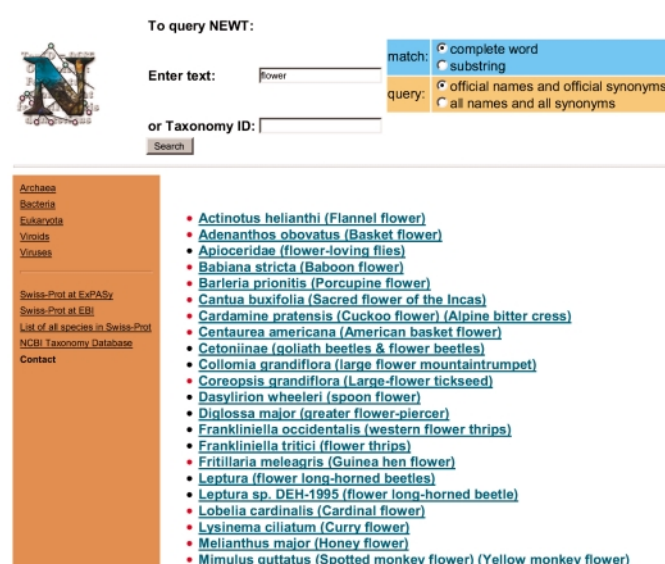
Figure 2. Search display on the NEWT web server.

NEWT can be searched by species name (either in scientific Latin or English), with an option to use wildcards anywhere