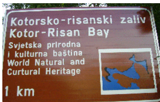
Fig 2. On the road to Kotor....

Signage and print media are elements that consistently emphasize the UNESCO logo. Jane Lennon in a UNESCO publication stresses the importance of the UNESCO logo use: “ The use of the World Heritage logo as an awareness device and marketing brand is also to be encouraged in promoting the inscribed cultural landscape ”(Les Cahiers du Patrimoine, 2002: 121) First it can be observed that on the three main roads leading to the Bay of Kotor are installed several square meters panels indicating the name of the site and its cultural and natural heritage status. In addition, as noted by Nota Pantzou, it is very rare to find a prospectus, or even a poster, without the UNESCO logo. Plans of the city, cultural programs and most tourist brochures are marked, if not with the logo at least with a reference to UNESCO.