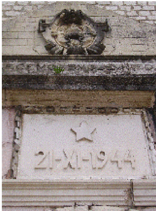
Fig 4. "Tude necemo svoje nedamo" (Naef, 2006).