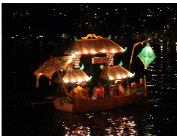
Fig 3. A Chinese gondola during the Boka Night (Naef 2006).

In February, a winter carnival honors St Tryphon, the patron saint of Kotor, attracting large crowds for its presentation of the life and customs of the Boka's seafaring inhabitants. Six years ago, a summer festival, described by its organizers as a summer version of the traditional February festival, was launched. It is perceived in some quarters as above all a commercial version of the winter carnival. In 2006, the summer festival was held from 1 to 5 August. Each day visitors were invited to sample regional culinary specialties, attend theatre performances or watch fancy dress parades. Highlights were a fancy dress competition and a big party, mainly for young people, in the old town.