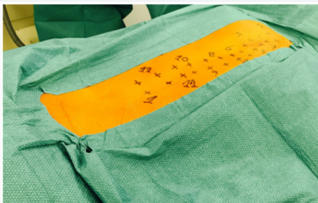
Figure 1: After prepping and draping, the levels of the pedicles of the vertebrae to be instrumented and fused are marked using fluoroscopy, to allow for planning of the 3 separate skin incisions. The 3 incisions will be made on the median line and centered over the pedicles of the vertebrae to be instrumented. Right side of the picture: cephalad.

The patient is installed prone on a radiolucent table, as for a conventional posterior approach. After prepping and draping, fluoroscopy is used to determine the length and localization of 3 separated midline skin incisions (Figure 1). Fluoroscopy use is limited to the planning of the skin incisions [14].