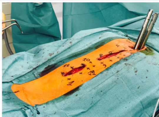
Figure 3: Intraoperative view showing the 3 posterior skin incisions, centered over the three segments of instrumentation. The prepared pedicles remain located with pedicle markers (not visible deeply in the wounds). Facetectomies and decortication have been performed, and bone graft has been applied. Right side of the picture: cephalad.

Three segments are instrumented, one per skin incision (Figure 3). The facet joints located between skin incisions are not instrumented, but facetectomies, decortications and bone grafting are still performed by mobilizing the skin and soft tissues.