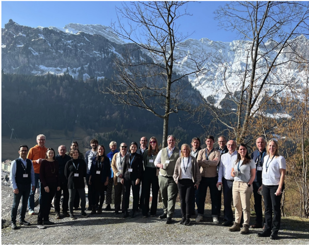
Fig. 1. Participants of the conference in front of the Swiss Alps.

in diagnostics and highlighted future applications, including antimicrobial resistance and gut microbiome studies. However, there is a need for cost-benefit studies and the involvement of economists to make a compelling case for the routine use of sequencing in healthcare settings.