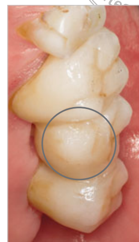
Fig 3 Clinical image of a control FDP exhibiting a veneering ceramic fracture, rated Charlie by means of the USHPS criteria.

fractured areas were thoroughly polished using ceramic polishers (OptraFine, Ivoclar Vivadent).