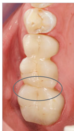
Fig 2 Clinical image displaying a test FDP with a minor chipping of the veneering ceramic, rated Bravo by means of the USHPS criteria.

At the two test FDPs that had minor chippings, in addition fracture lines within the veneering ceramic, along the distal connectors were observed (Fig 2). The