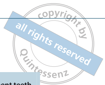
Table 4 Mean values and standard deviations of the biologic parameters at abutment teeth (test) and analogous contralateral untreated teeth (control) of both types of FDPs at 1 year