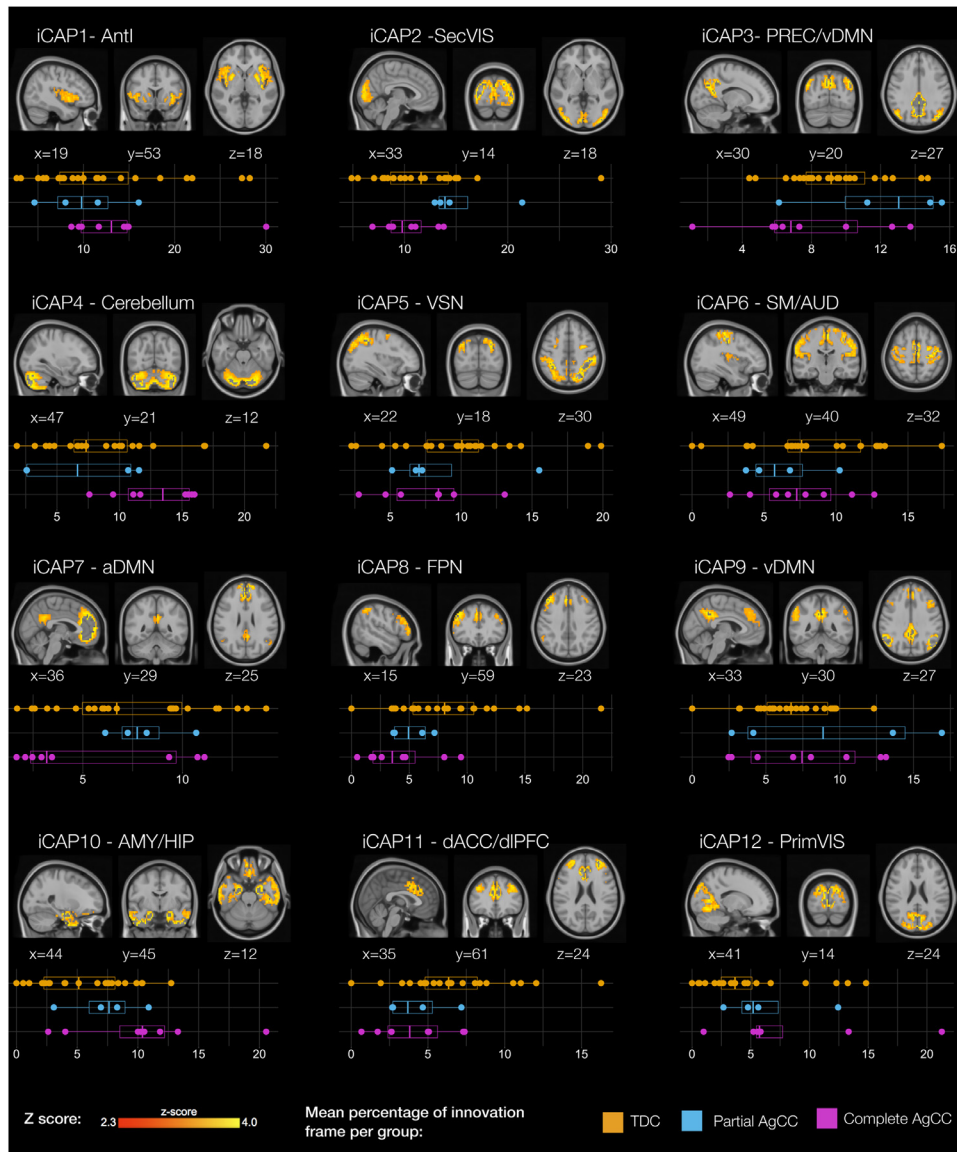
Fig. 1. Spatial patterns of the 12 innovation-driven coactivation patterns (iCAPs) retrieved from all subjects. Locations denote displayed slices in Montreal Neurological Institute coordinates. For each iCAPs, pie charts show the innovation frames per group as a percentage of the total nonmotion scanning time, including complete AgCC, partial AgCC and TDC. Spatial patterns of the 12 iCAPs include: AntI, anterior insula; SecVIS, secondary visual; PREC/vDMN, precuneus/ventral default mode network; Cerebellum; VSN, visuospatial network; SM/AUD, sensorimotor/auditory; aDMN, anterior default mode network; FPN, frontoparietal network; vDMN, ventral default mode network; AMY/HIP, amygdala/hippocampus; dACC/dIPFC, dorsal anterior cingulate cortex/ dorsolateral prefrontal cortex; PrimVIS, primary visual.