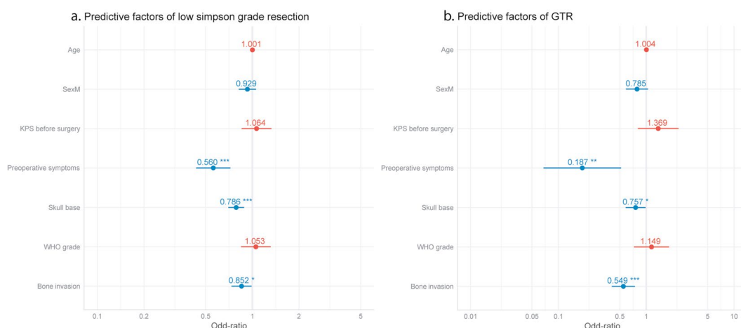
Figure 1. Forrest plots of predictive factors for meningioma surgical extent of resection. (a) Predictive factors of a good resection based on the Simpson grade. (b) Predictive factors of gross total resection (GTR).

the surgical EOR in meningiomas 9–11,13 . The preoperative KPS was not a significant predictive factor of EOR despite being predictive for postoperative neurological outcome, OS and PFS 14,15 . Age, preoperative KPS, and female-to-male ratio in our cohort were comparable to meningioma patients characteristics in the literature 5,11,13,16–18 . Similar to other series 11,19 , a Simpson grade I resection was achieved in 39.4% and a GTR in 78.9% of the cases.