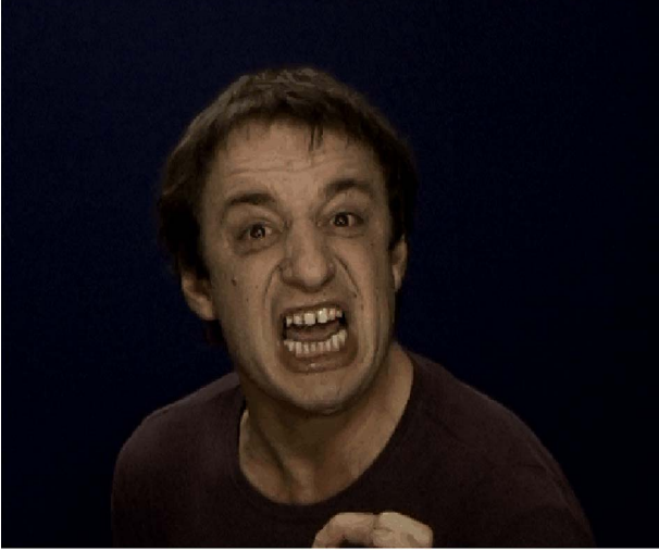
Fig. 1. Example of the GEMEP-FERA data set: One of the actors displaying an expression associated with the emotion “anger.”

under the ROC curve for 13 AUs. For an overview of more recent work by researchers at CMU, see [29].