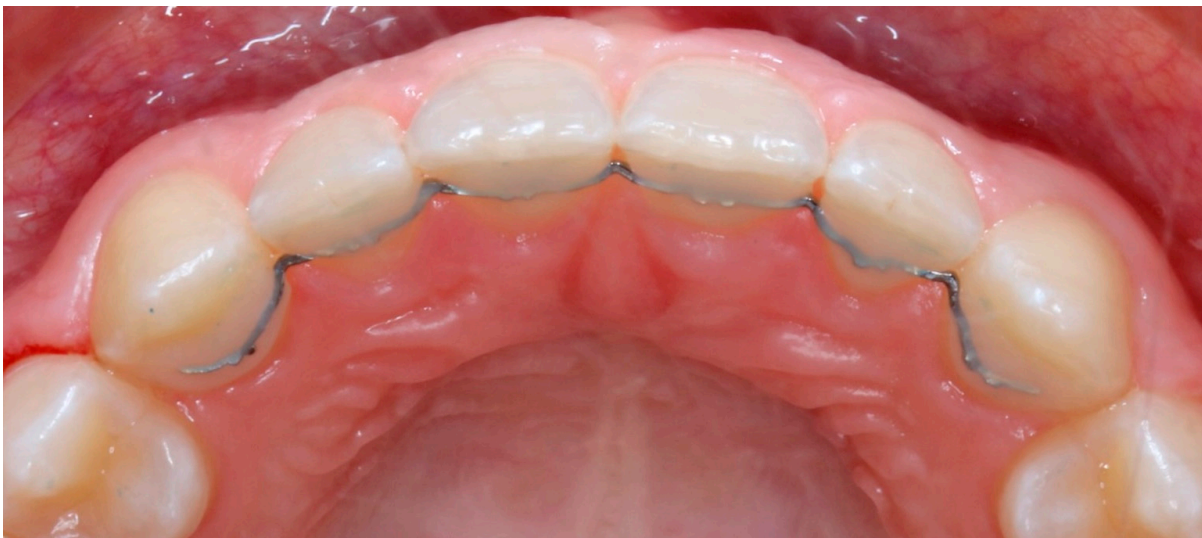
Figure 1. Picture of a 3 + 3 Memotain ® fixed retention wire after bonding.

The present investigation was a retrospective cohort study. Consecutive patients who received CAD/CAM nickel–titanium (NiTi) fixed retainers (Memotain ® , CA-Digital, Mettmann, Germany) between January 2017 and December 2020 were screened for eligibility. Patients were eligible for inclusion if they had at least one Memotain ® fixed retainer bonded by a single experienced orthodontist (LH) at the end of active orthodontic treatment (Figure 1) and attended scheduled retention follow-up visits at approximately 6 months (T1) and 12 months (T2) after debonding.