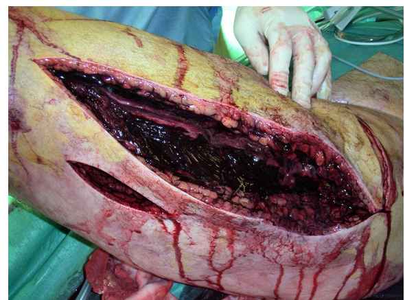
Fig. 2 Muscle necrosis (black) of a thigh during surgical debridement in a patient with toxic streptococcal toxic shock syndrome due to S. pyogenes necrotizing fasciitis