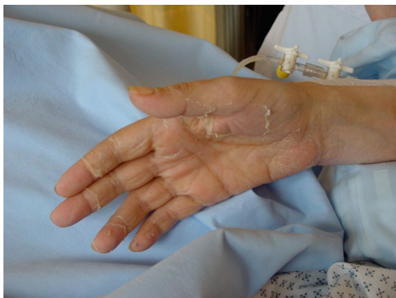
Fig. 1 Palmar desquamation occurring a few days after STSS

The third phase of clinical presentation is characterized by circulatory shock that can be sudden and profound, accompanied by multiple organ failure. Despite aggressive therapy many patients will die within 24–48 h of hospitalization.