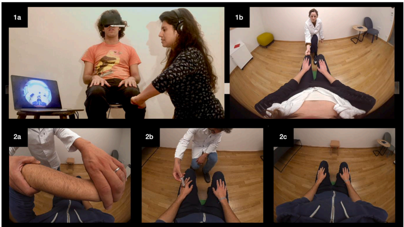
Fig. 2. 1a) Illustrates a male participant wearing the HMD with an olfactory pen attached to it while receiving tactile stimulation from the experimenter. The experimenter wears headphones where the timing for the tactile stimulation is presented while at the same time visually monitoring the gestures. 1b) depicts what is seen at this moment by the male participant on the HMD. 2a, 2b and 2c depict zoomed-in frame captures from the immersive videos presented on the HMD to female participants. The first illustrates the initial gesture of their own arm being brought towards their nose, the second shows a threat (a syringe pinching the hand), and the third depicts the static sitting position.

In total, participants underwent four conditions, one for each odor. The conditions were presented in a semi-counterbalanced manner, and each was followed by an embodiment questionnaire.