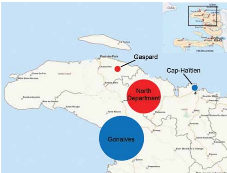
Figure 1. Study sites used to determine mortality rates during cholera epidemic, Haiti, 2010–2011: entire town of Gonaïves, urban slum in Cap-Haïtien, rural communal sections in North Department, and communal section of Gaspard. Red circles, rural sites; blue circles, urban sites. Circle size is proportional to the estimated population of each site.

The study design called for sampling 16,000 persons at each site. This sample size was sufficient to estimate a crude mortality rate of 18 deaths/1,000 person-years (95% CI 14–22), which represents twice the expected crude mortality rate for 2010 in Haiti (9 deaths/1,000 person-years) by the United Nations World Population Prospects (8) (online Technical Appendix, http://wwwnc.cdc .