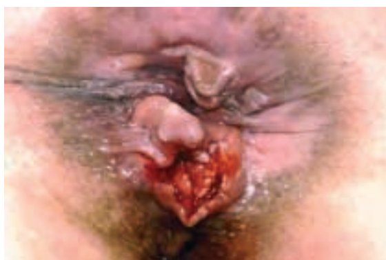
Figure 2 Squamous cell carcinoma of the anus.

Anal margin and anal canal tumours have different patterns of lymphatic drainage. Cancers arising from the more proximal anal canal (above the dentate line) drain predominantly into the peri-rectal and iliac lymph nodes, while tumours within the distal canal and the anal margin drain exclusively into inguinal lymph nodes. At presentation, approximately 50–60% of patients will have a superficial (T1 or T2) lesion, and 25% of patients will have involvement of regional lymph nodes. 10% of patients have distant metastases at the time of diagnosis [30].