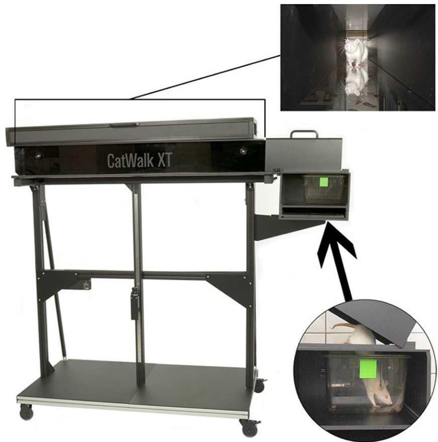
FIGURE 1 CatWalk Set Up: Animals cross the tunnel from left to right. Their footprints on the glassplate are detected by the camera below and transferred to the computer

6 mm (Figure 1). The area where a paw contacts the floor is visualized, using an optical trick. An encased fluorescent tube is put alongside the distal long edge of the glass (as seen from the observer) so that light enters the glass from the edge (Clarke, 1992; Clarke et al., 1992). Some distance away from the edge, the light is completely internally reflected in the glass (same principle as fiber optics), except in those locations where air has been replaced by another medium such as a paw; there, light leaves the glass and illuminates the paw. In this way it is only the contact area that lights up clearly. Moreover, the applied pressure is representative for the intensity of the light, enabling the walkway measuring the force used by the paws (Hamers et al., 2001; Vrinten & Hamers, 2003).