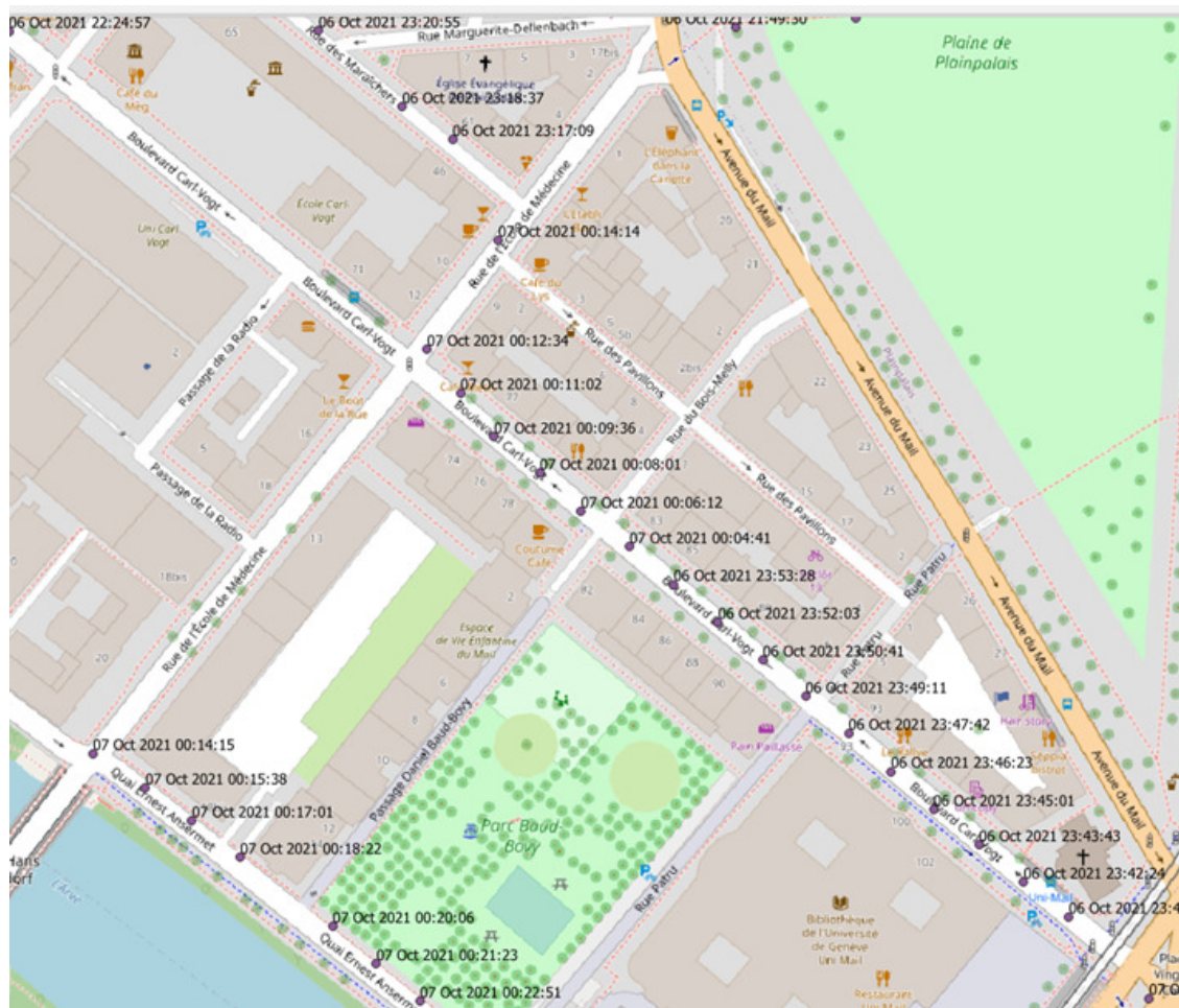
Figure 1. Visual snippet of geospatial data for the passage of the vibrator trucks.

Screenshot of the passage of the vibrator trucks next to the University of Geneva, taken from software QGIS, with the SIG proprietary data superimposed to the official map of the canton of Geneva. Purple dots represent the data collection points of the vibrator trucks, while the date represents the date and time of each collection point, accurate to the second.