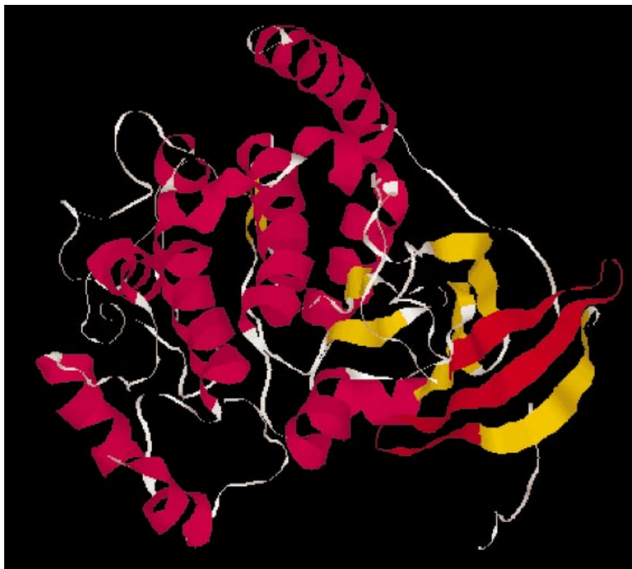
Figure 1. A search on the PDB database with the PROSITE pattern PS00107 (directed against the ATP binding region of the kinase domain) was performed on the ScanProsite page. The pattern identified 221 matches. The 1CTP entry was selected to visualize the position of the pattern on the 3D structure. The ATP binding region is highlighted in red. The ScanProsite page uses RasMol (16) scripts to produce images. An interactive view with the Chime program is also provided.