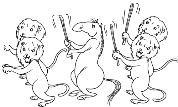
Figure 1. Sample of stimuli used in Experiment 1.

All sentences included transitive reversible verbs. The relative head and the other argument in the RCs were always mismatched in number; one in the singular and the other in the plural, with singular and plural being counterbalanced. All RCs included a verb inflected for either third person singular or third plural agreement (counterbalanced across items) and plural agreement was always phonetically audible. Sentence length was similar across items. We used verbs with audible agreement to make this experiment parallel to the Italian one, where agreement is always audible. We acknowledge that in Schelstraete and Degand's (1998) experiment agreement was not audible and this may be a limitation, although in unpublished work we found that there is no difference between relatives with or without audible agreement. Experimental items were interspersed with 12 fillers, which were either subject RCs with intransitive verbs (3 items) or simple descriptions of individuals (e.g., Les hommes sur les arbres 'The men on the trees'). All the sentences were recorded by a female native speaker of French. All the sentences were introduced by show me ... and were spoken along with a picture displaying three sets of characters, as in Figure 1 .