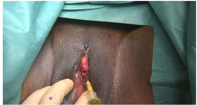
Fig. 4 Injection of autologous platelet-rich plasma (A-PRP) into the body of the clitoris