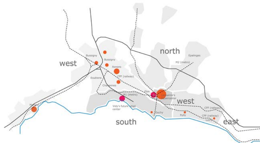
Figure 1. Retail centers gathering around the highway junction in the Western communes at the conurbation scale.

Regarding the conurbation's west "communes", before 2000 there was, according to Bieler from the SDOL bureau (2012) a rush to cope with the attractiveness of having the first multiplex shopping center. There was a wave of car-driven retail centers, and from this period dated what was later called the "Arc-en-Ciel" sector surrounding by the A1 cross one of the black points of the Confederation highway system. The Canton decided to impose a moratorium to all western communes: all urban projects would be stopped until they came up with a mutualized vision regarding developments that were generating more car flux and thus, air pollutants. This led to a convention document, which was not under any regulation the SDOL (Developing Scheme of Western Lausanne). The SDOL is a product of a conciliation frame: the communes that subscribe it could withdraw at any time since it is not enforced by regulations but just a convention between neighboring communes. The vision proposed by the SDOL is generated around the main objective of stabilizing motorized traffic, thus controlling the location of potentially car-flux generators such as retail centers. The SDOL led later to the PALM (Project of conurbation Lausanne, Morges) that enlarged the convention of the SDOL to the north and east sectors of the conurbation. In short, the PALM project was a bottom up process, starting with agreements from the western communes and expanding to the entire conurbation.