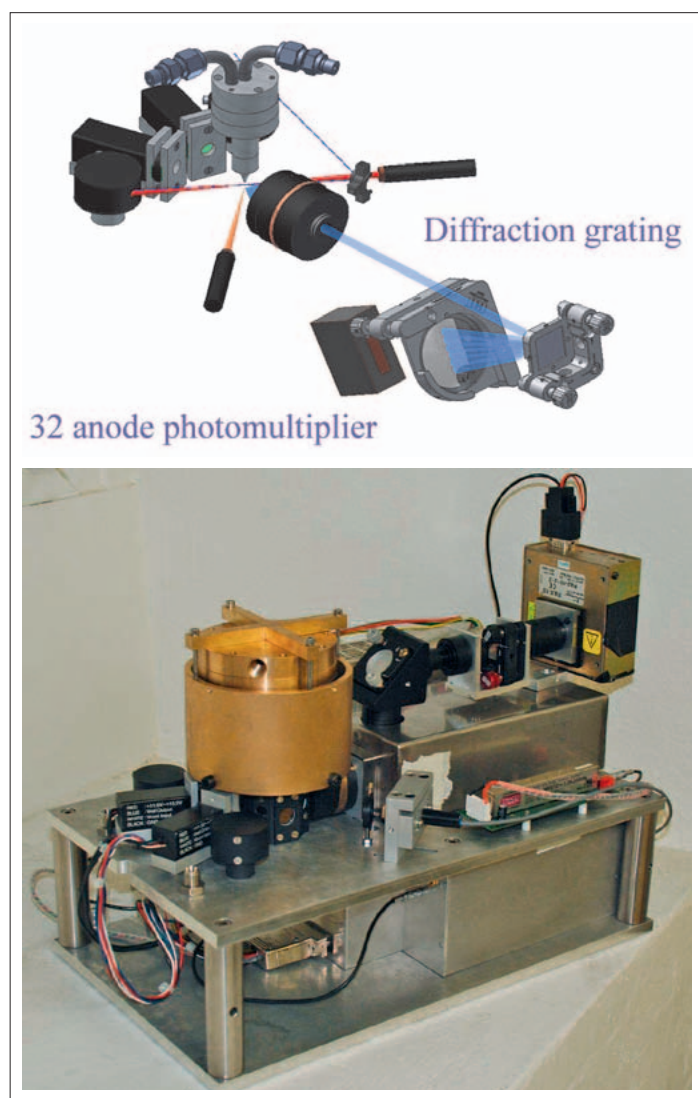
Fig. 3. Aerosol analyzer. Upper panel: CAD drawing of the main parts of the device (nozzle, 2 crossed CW lasers, 2 PMTs, reflective objective, diffraction grating, 32-anode PMT). Lower panel: picture of the device in the lab.

A particularity of this set-up is the detection of the fluorescence in the backward direction. We indeed demonstrated that light emission from airborne particles is enhanced in the backward direction, especially if the process is nonlinear. [21–23] Flexibility on the type of bacteria is provided by seeding the thermode-nuder with two piezo-nozzles, one dedicated to the spread of the bacteria A (e.g. Gram+) and the other to bacteria B (e.g. Gram-). As the