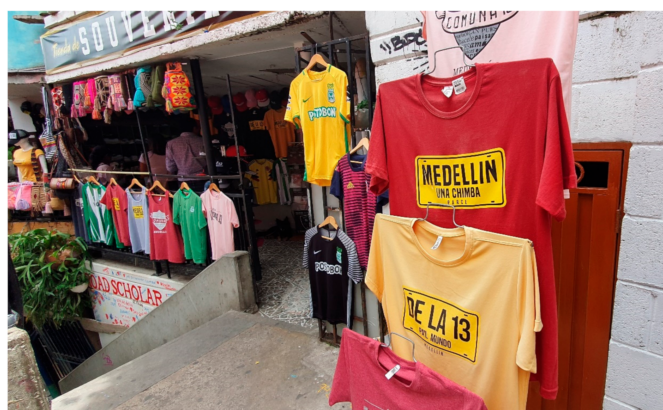
Figure 3. A souvenir shop selling tee-shirts and other products with the comuna 13 brand.

or improve the life of its residents. It is city-marketing or city-branding. And they sold it very well! It was featured in the news; it got a lot of success.” [63] After the success of this branding process and the tourism that followed, many residents started to criticize the increasing commercialization of their neighbourhood. With the development of tourism, souvenir shops, cafés and art galleries arose all around Las Escaleras and on the new viaduct overlooking them. The comuna 13 itself became a brand and is now featured on all the merchandising sold to tourists: tee-shirts, postcards, caps, mugs, etc. (Figure 3)