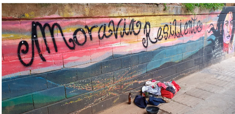
Figure 2. A mural from a local artist in Moravia representing resilience.

Presenting resilience merely as a part of the official branding discourse would clearly be an overstatement. Within the community of Moravia, the notion of resilience has certainly been adopted and is also part of local narratives and representations, as some murals in the neighbourhood can testify (Figure 2) Cielo herself integrates this notion in her discourses, presenting Moravia “as the only neighbourhood in Medellín with a history of resilience . . . It is like the phoenix that rose from the ashes.” [52] Moreover, in 2020 during the World Tourism Day, the municipality and its tourism promotion branch, the “Convention and Visitors Bureau”, awarded Moravia Tours a prize for the creativity of its offer. Mentioning the resilience of Moravia, the “Creative Tourism Network” which was co-organizing the event, praised the collaboration of the communities and the authorities: “The city of Medellín is undoubtedly a model for this new kind of tourism, if we refer to its communities’ creativity and resilience and the smart involvement and management of the City Council in fostering them.” [53] Nevertheless, as some of the examples presented above demonstrate, two opposing representations of resilience can be identified: an official one produced by the city, focusing on the transformation of the site, and a community-driven one, questioning some features of this transformation.