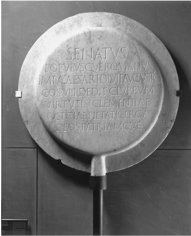
Fig. 15.4. Arles: Marble copy of the clipeus Virtutis , prob. 26 BC (AE 1952, 165).

of the relationship between the Forum of Augustus and the Parade of Heroes in Aeneid 6, when Aeneas sees in the Underworld the future generations of Romans waiting to be born. 58 Some scholars argue that the date of the dedication of the Forum, 2 BC, precludes any possible interaction between the text and the monument. Others, however, argue that direct influence on the Aeneid is indeed possible given that the temple was originally dedicated at Philippi in 42 BC and that Vergil could have had knowledge of ongoing planning. 59 Happily, only one small detail of this debate need concern us here. It has often been noted that the images of the Roman ancestors in the Forum contained encomiastic inscriptions recounting their most famous deeds. One of the surviving fragments reads thus (CIL VI 8.3 40931; Fig. 15.5):