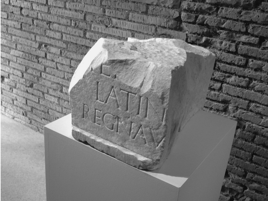
Fig. 15.5. Rome, Museum of the Imperial Forums: fragment of pedestal from the Forum of Augustus in Lunense marble with inscription referring to Aeneas (CIL VI 8.3 40931).

Aē[e]ā[s primus] | Latin[orum rex] | regnav[it annos III]. (Aeneas, [first king] of the Latins, reigned [for three years].) (CIL VI 8.3 40931)