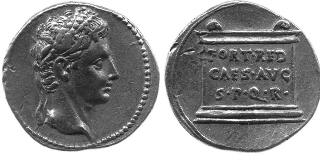
Fig. 15.2. Gold coin; 20–19 BC. Left (obverse): head of Augustus, laureate; right (reverse): rectangular altar, inscribed: FORT·RED/CAES·AVG/S·P·Q·R· (RIC 1 53a, p. 45). © The Trustees of the British Museum R.5986.