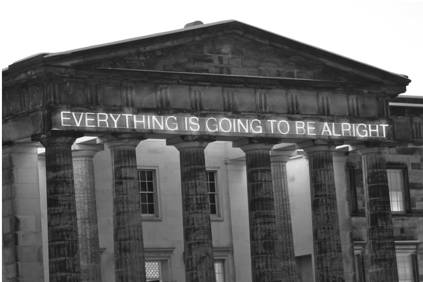
Fig. 15.7. Scottish National Gallery of Modern Art, Edinburgh, 7 December 2010.

If we are prepared to believe that the poets of Augustan Rome did indeed consciously relate their works to the explosion of inscribed texts born of the Augustan furor epigraphicus , we may perhaps end with a final thought that brings us back to the theme of periodization with which we began. Some scholars argue that Vergil, Horace, Propertius, and Tibullus are better thought of as Triumviral poets and that Ovid, in chronological terms, is the only major poet who may be thought of as truly Augustan. 95 Considered in this way, he may be our best poetic witness to Augustus and the birth of imperial epigraphy. And if that is the case, then Ovid becomes an important figure in the history of the phenomenon this book is attempting to survey. Either way, and at the end of the day, it may be argued that Ovid's expression of hope in some kind of literary immortality at the end of the Metamorphoses is a statement of optimism that is quite in keeping with a recurring and essential theme in the Augustan discourse of peace and renewal, and one that practitioners of the epigraphic habit are still keen to convey in the modern equivalent of litterae aureae (Fig. 15.7).